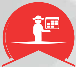
Attendance Management System (AMS)